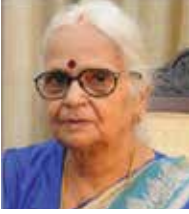
Smt. Mridula Sinha Governor of Goa